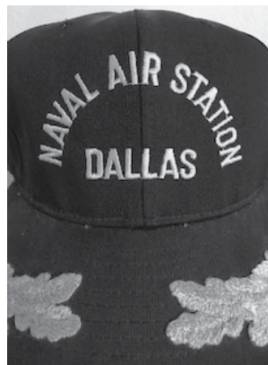
NAS Dallas was located on Mount Creek Lake in southwest Dallas. Decommissioned December 1998.