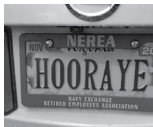
Ray Eaton's License Plate