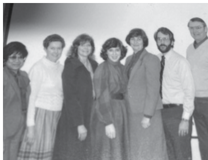
FSO Auburn Regional Personnel Staff