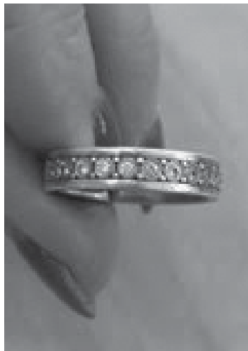
45 Year Service Award