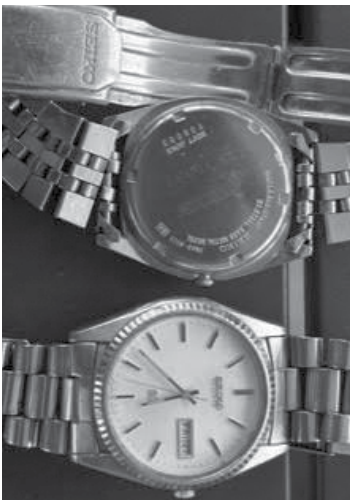
Is your 25 Year Sieko Watch Still Working?