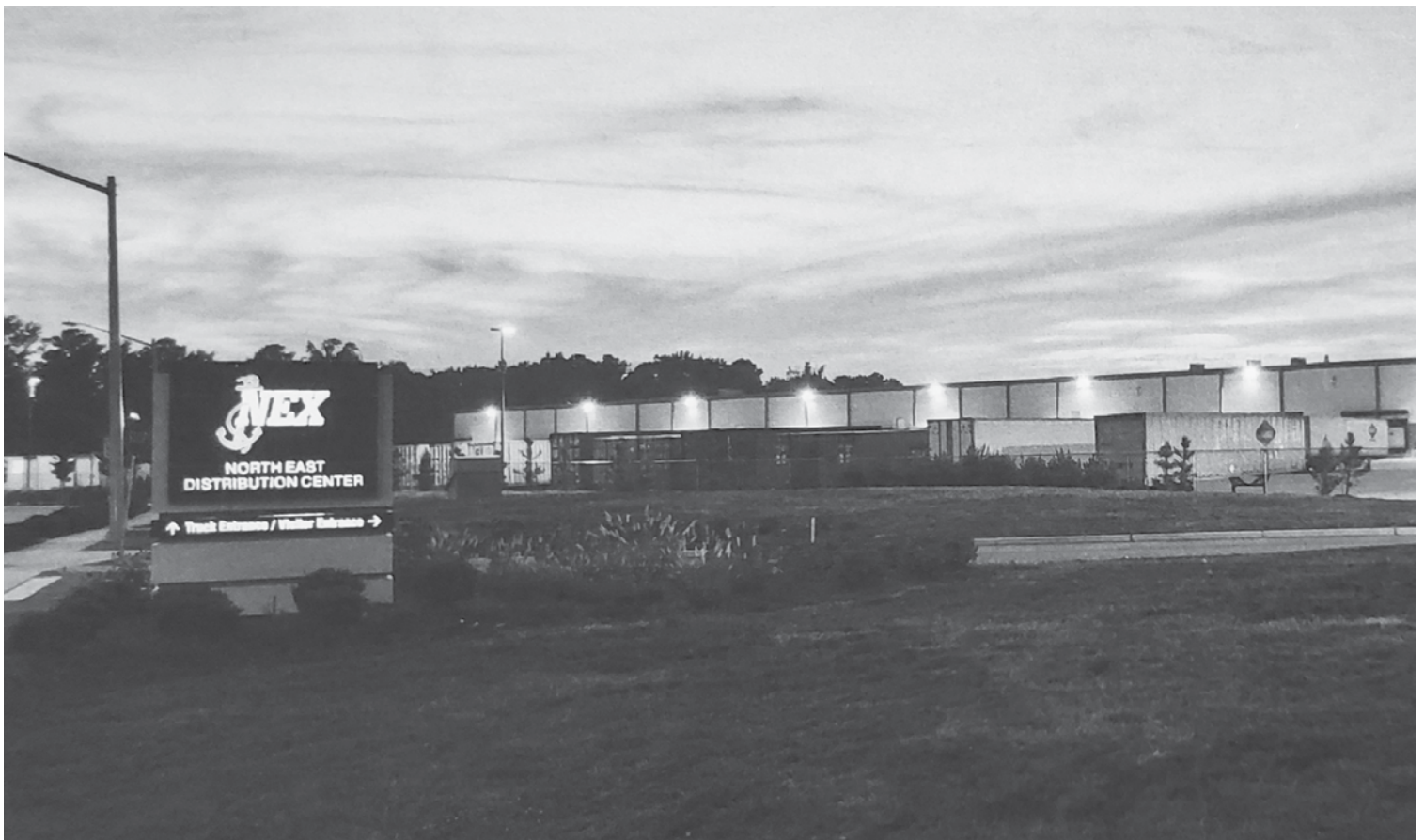
Suffolk Distribution Center NEDC