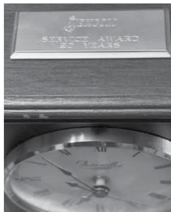
20 Year Award Clock