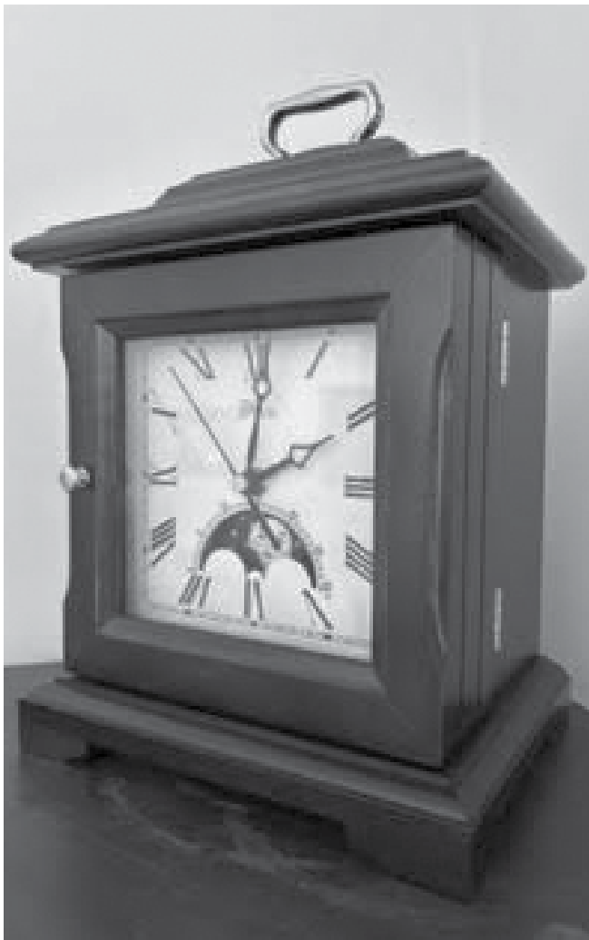
30 Year Award Clock