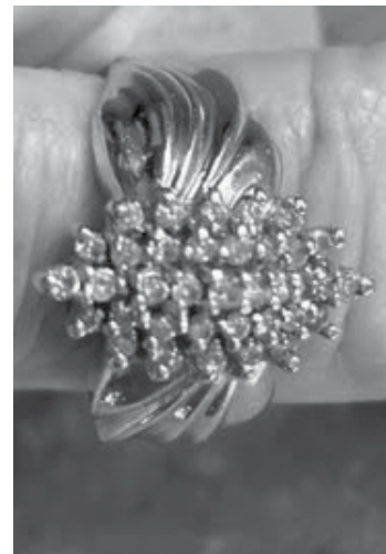
30 Year Service Award