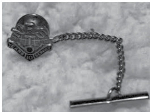
Did you get a tie tack?

Please email Memory Section articles or pictures you would like to share to nereanational@gmail.com