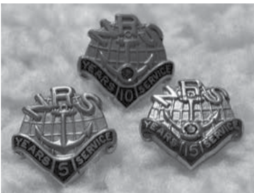
5, 10, 15 Year Pins