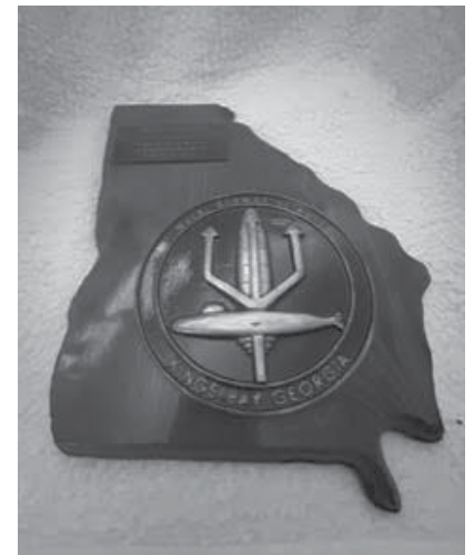
Cool Plaque NEX NSB Kings Bay, GA