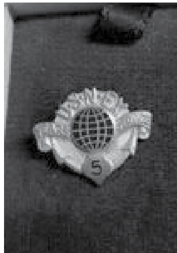
1959 USN EX 5 Year Service