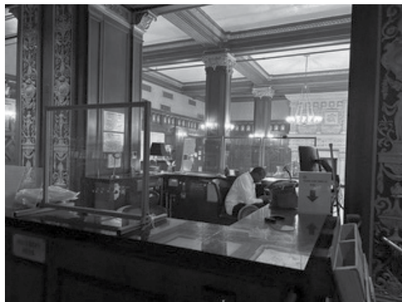
Trivia question #3: Lobby of Prince George Hotel

Please email Memory Section articles or pictures you would like to share to nereanational@gmail.com