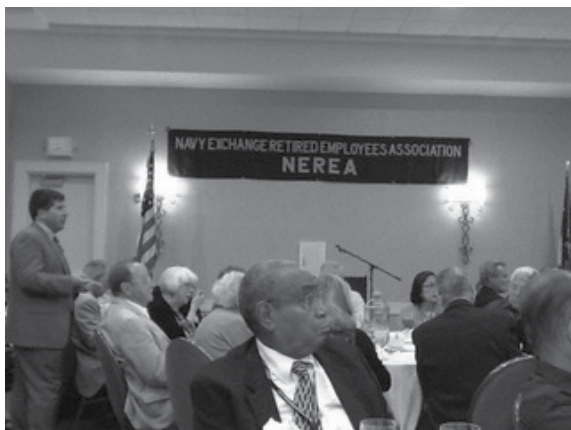
NEREA convention Charleston SC May 2013