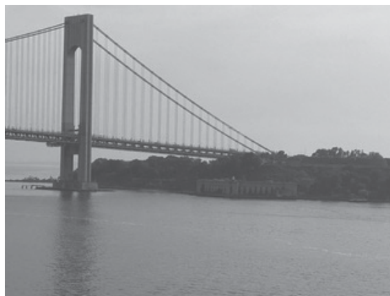
Did you cross the bridge or ride the ferry when TDY to Headquarters?