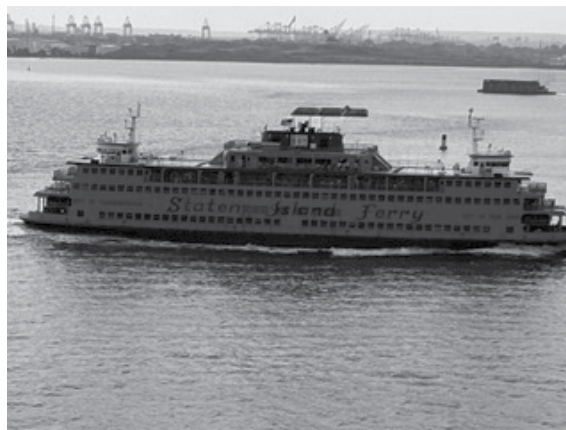
If case you forget, Staten Island Ferry fare increased from 5 to 25 cents in 1975.