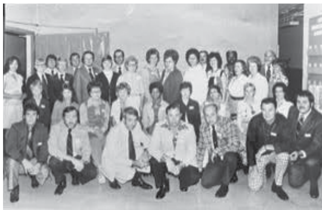
Personnel Mangers Conference 1976