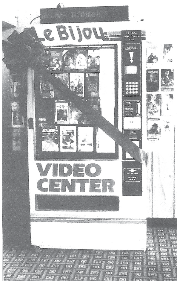
Answer to trivia question #7.